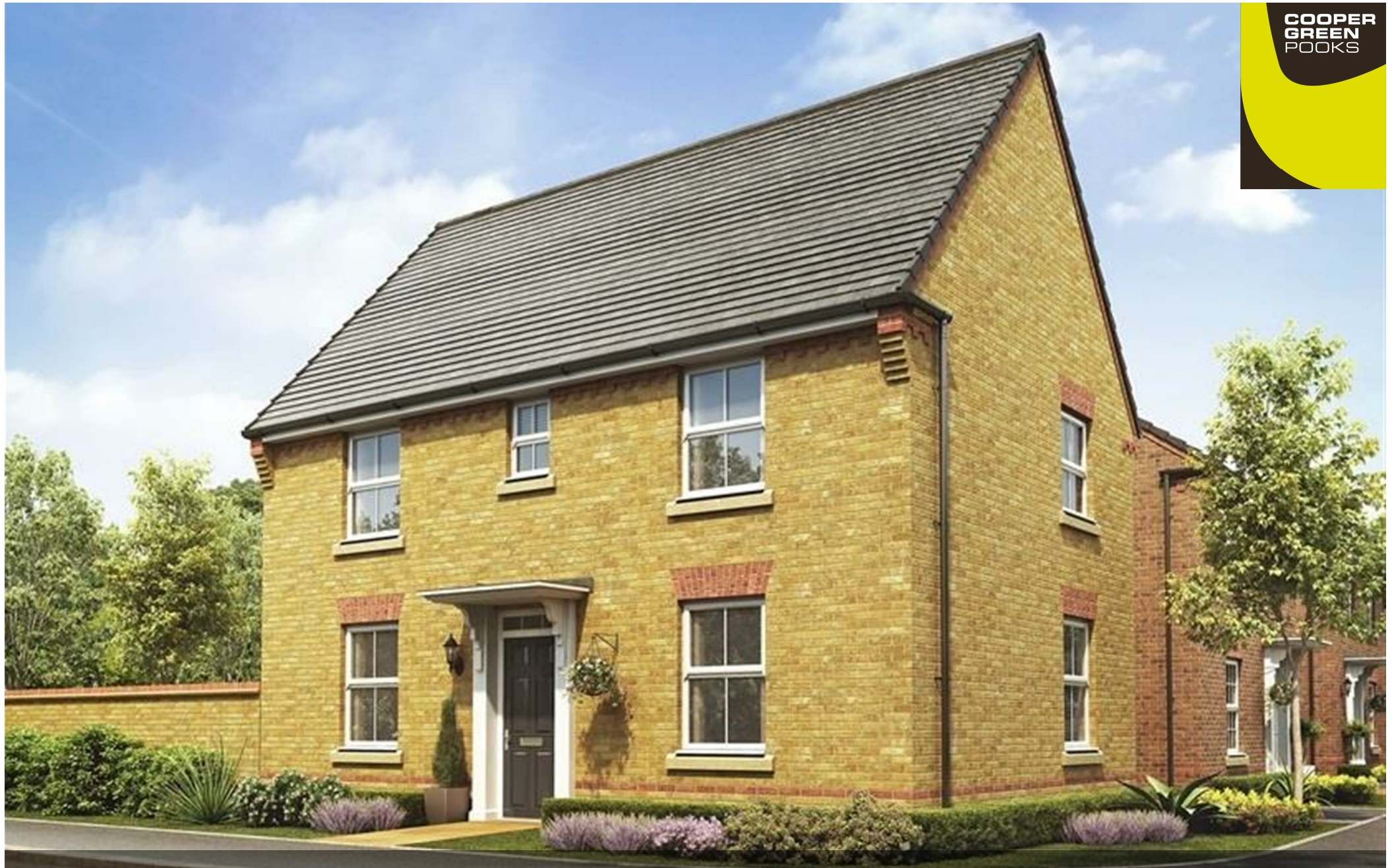
Plot 84, The Hadley, Rose Place, Welshpool Road, Bicton Heath, Shrewsbury, SY3 5BU £393,000